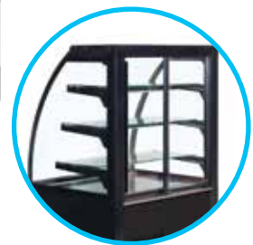
Rear sliding doors