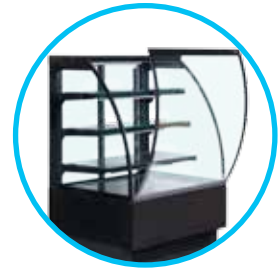
Hinged front glass for cleaning